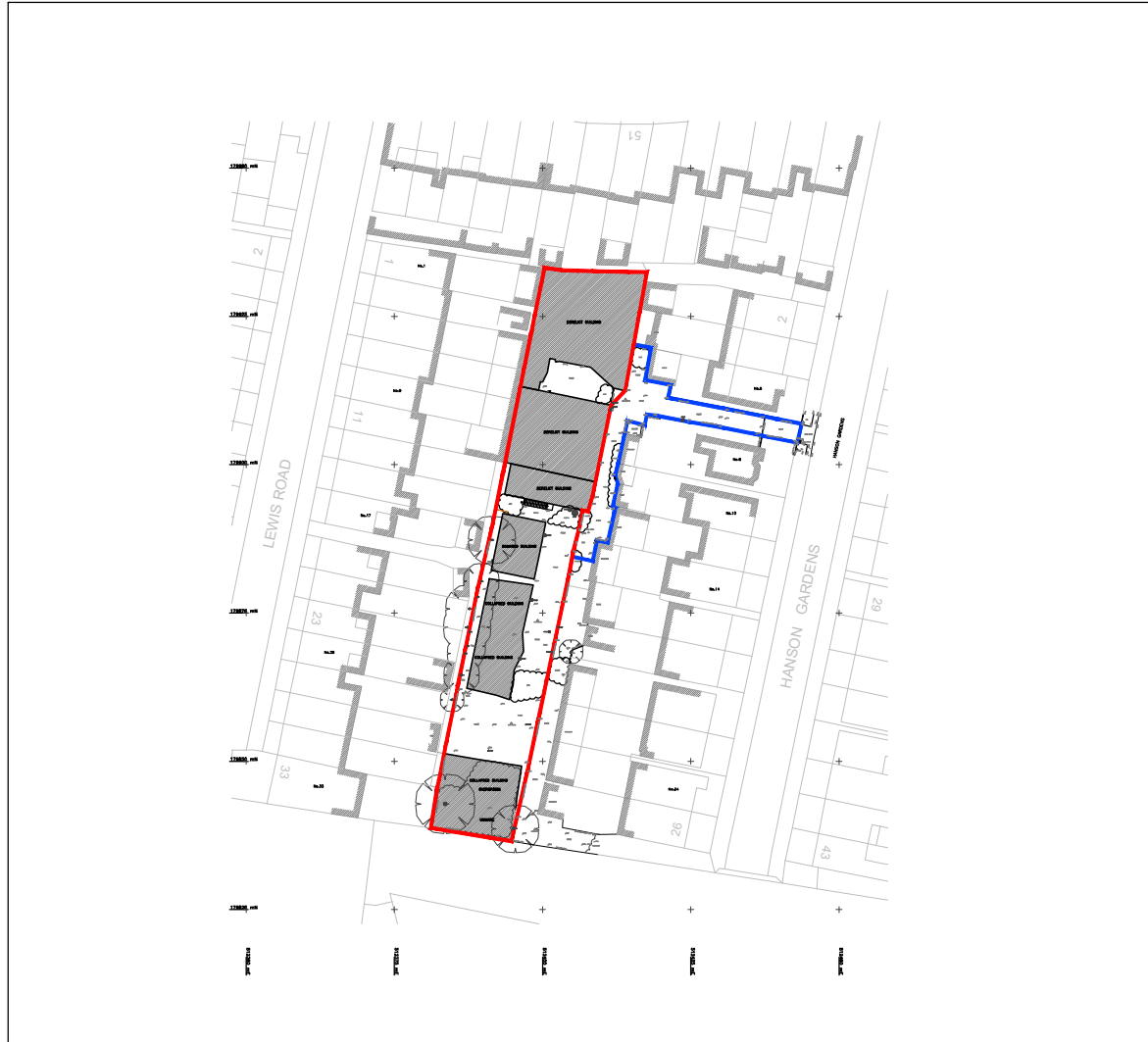
Site Location Plan - 1:1250