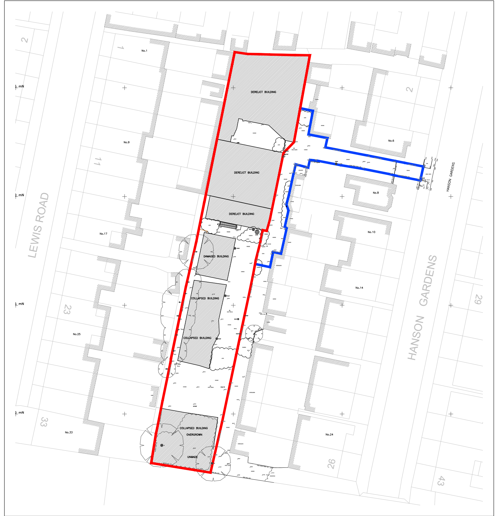
Block Plan - 1:500