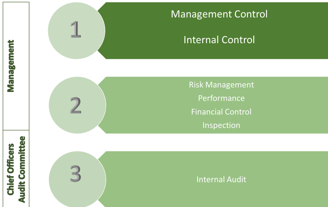
Diagram 1: Three Lines of Defence: Assurance

Assurance feeds from the risk based Internal Audit Plan to individual audit projects. Internal Audit employs a risk-based, systematic and disciplined approach to audit. The risk-based approach focuses on the materiality of transactions. As a result, it utilises risk to identify material or key transactions and tests a sample to ensure that the system works, thus providing assurance to management. It is management’s responsibility to maintain a system of internal control.